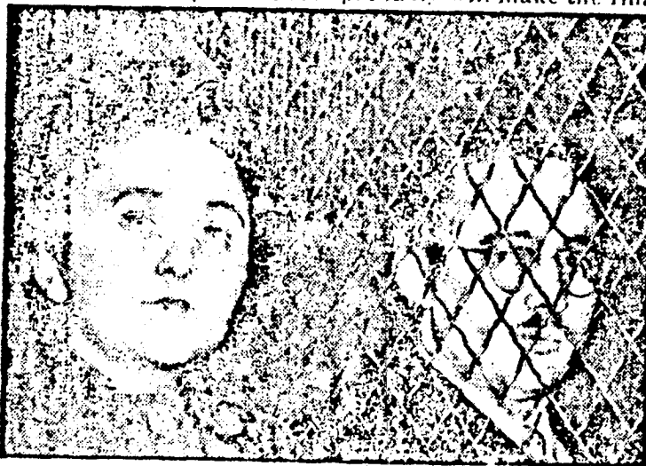
Ethel and Julius Rosenberg, shown as they rode to separate jails after their conviction as traitors, will ask Circuit Court of Appeals for a reversal today.

The U. S. Supreme Court probably will make the final